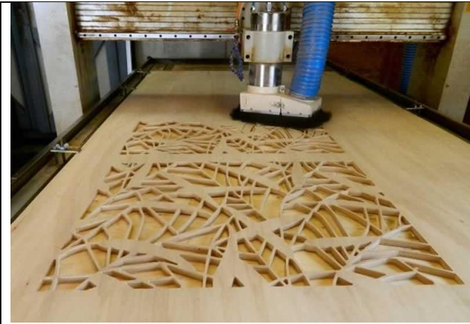
Few Images of the Work Output of this type of Machine (for reference purpose only)